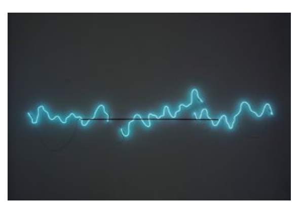
JAN VAN MUNSTER, Ratio, 2008, glass and argon, 150 inches (381 cm)